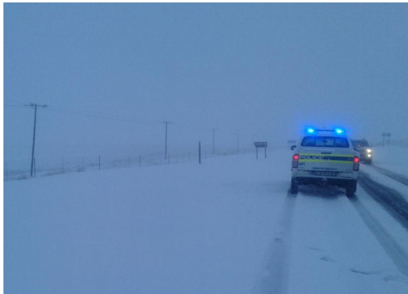
Figure 1: Eastern Cape snowfall this morning. Many roads and mountain passes are closed as snowfalls persist today over the province.